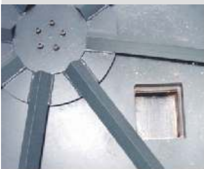
2. Slide filler...