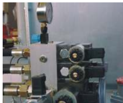
Well-conceived hydraulic system control guarantees economical operation