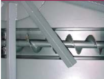
1. Worm screw... (S-Series)

Reinbold briquetting presses are suitable for virtually all types of material that can be formed into briquettes such as paper, plastics, aluminium shavings, clay, textile fibres... Let us advise you!