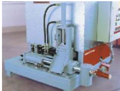
Compact arrangement of the briquetting unit underneath the funnel