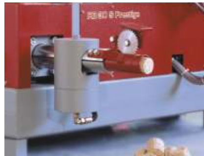
Not too large and not too small: Drive motors and gearbox