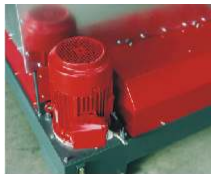
The compact and easy to maintain hydraulic unit